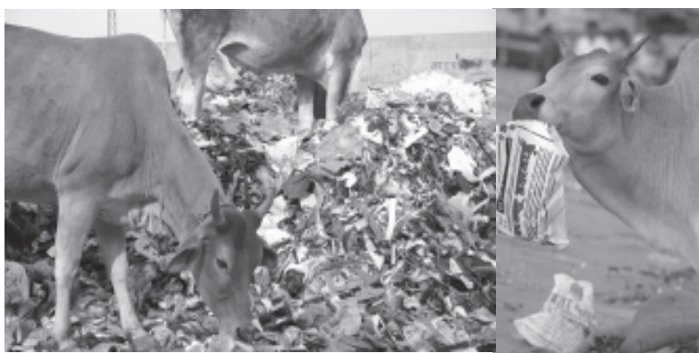
Fig. 10.3: A pile of plastic bags along with leftovers- a cow eating them