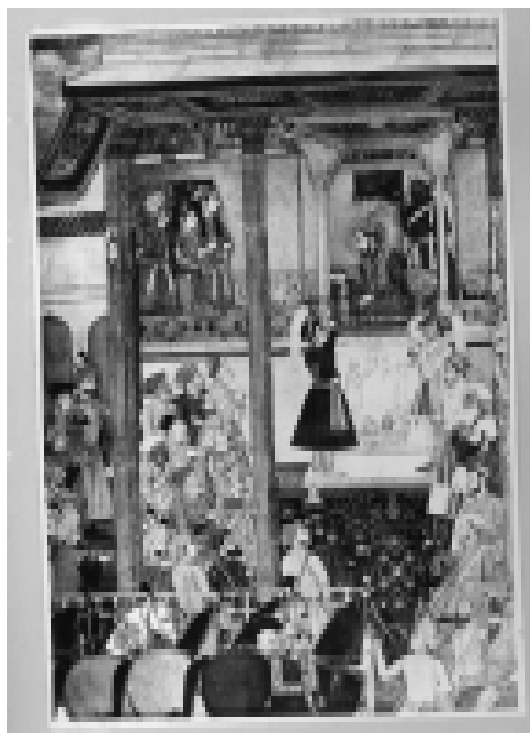
Fig 12.1 Royal Court

Diwan-i Kul was the chief diwan. He was responsible for revenue and finances. Akbar had strengthened the office of diwan by entrusting the revenue powers to the diwan. The diwan used to inspect all transaction and payments in all departments and supervised the provincial diwans. The entire revenue collection and expenditure of the empire was under his charge. The diwans were to report about state finance to the Emperor on daily basis.